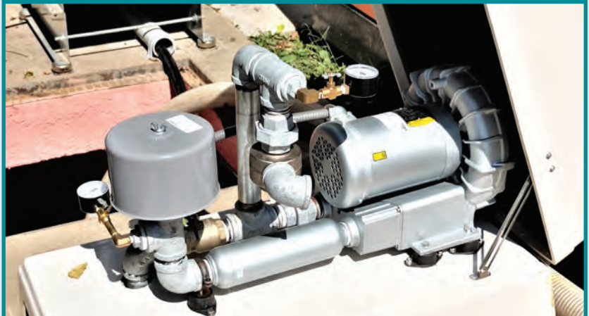
Weatherproof Enclosure (open)