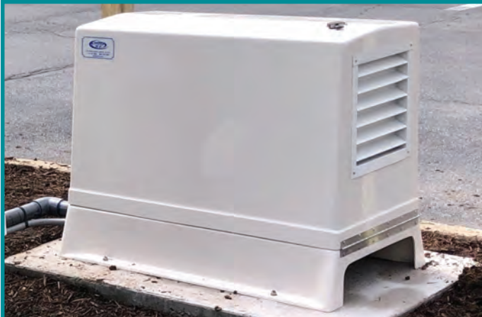
Weatherproof Enclosure (closed)