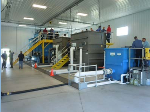
Aqua-Aerobic Research & Technology Center

Located on the grounds of Four Rivers Sanitation Authority (FRSA), our Research & Technology Center provides a unique opportunity to facilitate performance testing of engineered cloth media on various configurations, under controlled conditions to deliver reliable insights into optimizing commercial application.