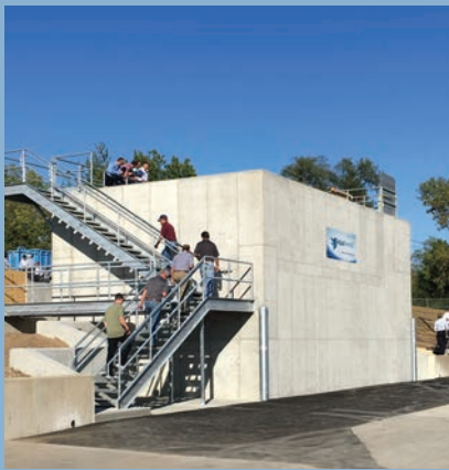
AquaNereda® Demonstration Plant

Tour the Aqua-Aerobic Research & Technology (R&T) Center and get an extensive overview of our full-scale AquaNereda® Aerobic Granular Sludge treatment plant on the last day of the seminar.