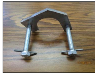
One (1) Spring Compression Tool 48781-003