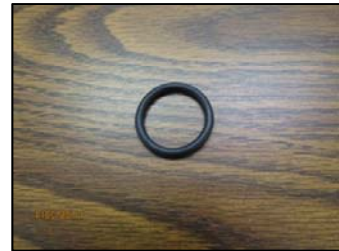
One (1) O-ring S816