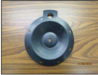
One (1) Diaphragm 38676-404 (19260)