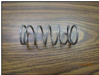
One (1) Compression Spring 38571-715 (17110) - red paint 38571-610 (17110) - no paint 38571-717 (17110) - black paint