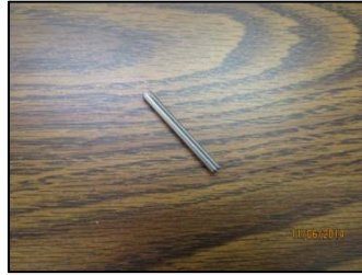
One (1) Roll Pin 21154-709