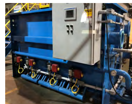
Restored to Peak Efficiency

When Aqua-Aerobic performs a mechanical assessment, it is followed by a detailed Mechanical Assessment Report defining potential issues affecting filter operational efficiency, capacity, or life expectancy. Many installations are utilizing the Mechanical Assessment Reports as tools to secure funding to perform needed repairs. An example of an assessment report is available upon request.