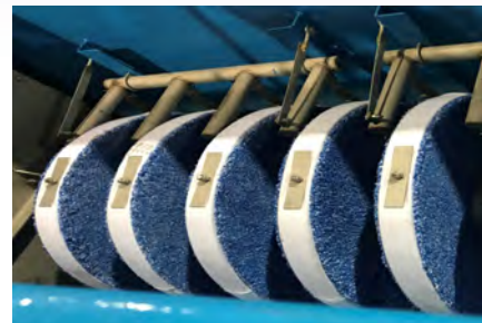
New Chlorine Resistant Pile Cloth