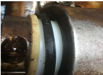
Deteriorating Bearings & Seals