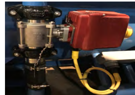
Faster Actuators with Better Control