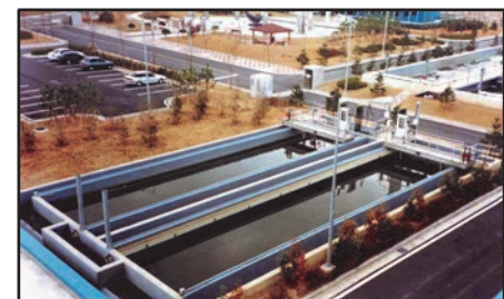
After: Upgraded to Peak Efficiency

When Aqua-Aerobic performs a mechanical assessment, it is followed by a detailed Mechanical Assessment Report defining potential issues effecting filter operational efficiency, capacity, or life expectancy. Many installations are utilizing the Mechanical Assessment Reports as tools to secure funding to perform the needed repairs. An example of an assessment report is available upon request.