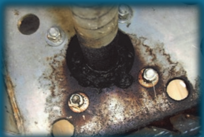
Bearings Leaking Grease