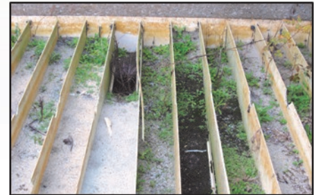
Before: Underdrain Damage