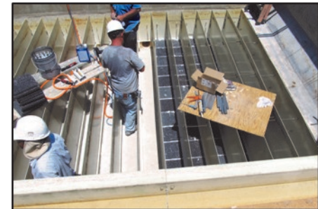
During: Underdrain Repair