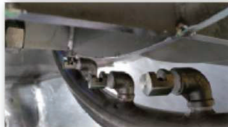
SELF CLEANING NOZZLE