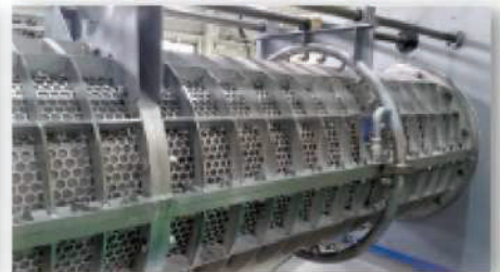
CHAMBER & SHUTTLE WASHING DEVICE