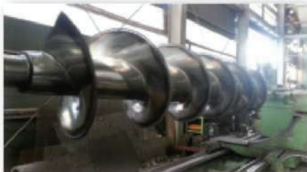
MAIN SCREW FABRICATION