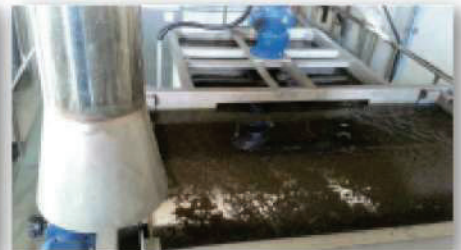
DRUM THICKENER DEVICE