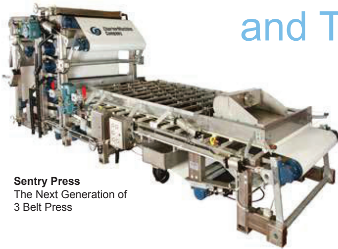
Sentry Press The Next Generation of 3 Belt Press