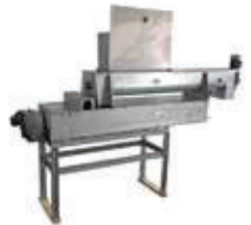
Roemix RM 240 Paddle Mixer Unit For Even Drier Solids

Whether its dewatering, thickening, polymer addition, conveyance or lime stabilization, Charter Machine provides customized and integrated biosolids solutions.