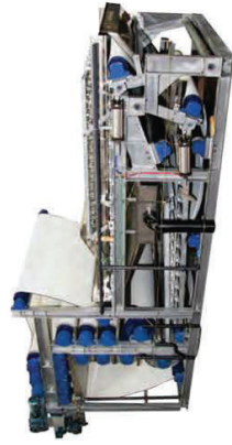
The Regent™ Press 15 Roll offers the same features as the Tower Press, but with increased cake solids.

Our pneumatic Belt Tensioning maintains consistent and even tension on the belt at all times for smooth operation and long belt life.