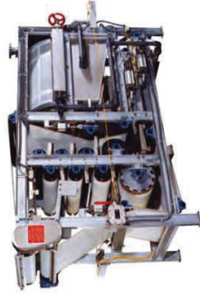
The Model TP7.4 Tower™ Press uses a drum instead of a gravity deck to minimize its footprint. This provides smaller plants with the same high performance dewatering results as larger presses, but for almost half the cost.